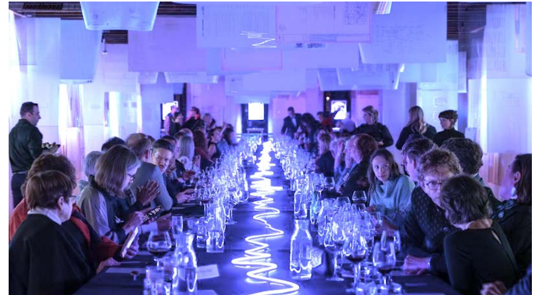
The Co ART DINNER, Oct 16, 2023