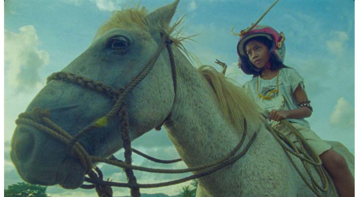
Film still, Tuan Andrew Nguyen: The Boat People November 5, 2021–January 16, 2022