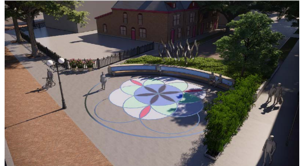
Artist Rendering: Seeds of Life , winning design, Oregon District Memorial (Fall 2024) Public Art Project by The Contemporary Dayton

Impact: Witness firsthand the positive impact of your contribution on our programs and the community we serve.