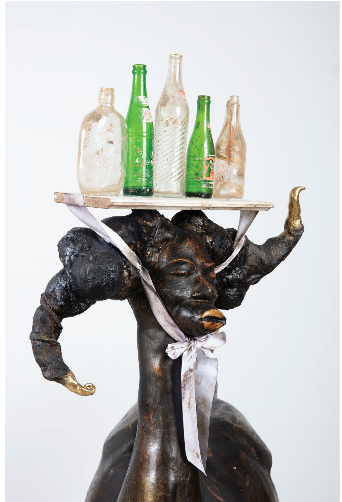
vanessa german BIRD #1 (detail) , 2022 wood, foam, black pigment, grace, the dream of a human woman who became a bird to tell us that we are all more than human, glass bottles found at the trash dump for the Biltmore— the largest house in America, astrofurf, love, an open heart gold metallic paint, plaster, plaster gauze wood, ribbon, astrofurf, love, an open heart 65 1/2 x 24 x 60 inches