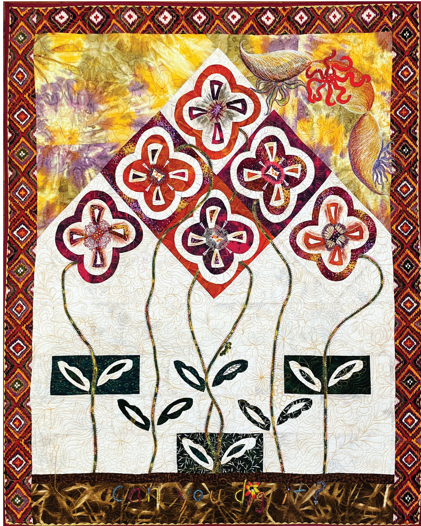
SANDRA KEAT GERMAN Can You Dig It , 2009 Silkscreen on cut-out felt 59 x 41 inches