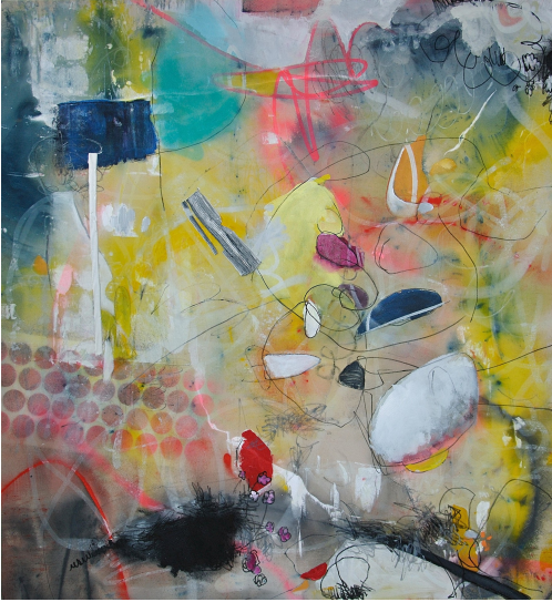
Haper, Tripping On The Light Behind Me , 2016, acrylic & spray paint on canvas, 52 x 48 in.