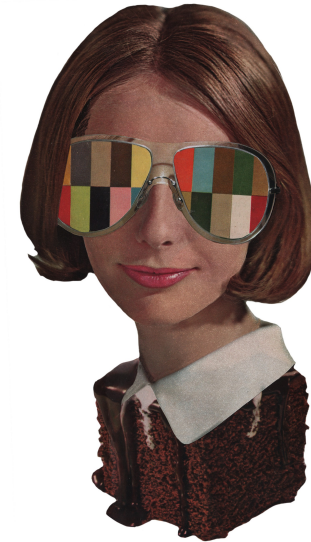
McCulla, 042515 , 2015, collage, 10 x 10 in.